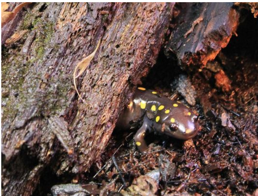
A spotted salamander habitat will open later this month at Sciencenter.

And for an added winter bonus, the Sciencenter is open on Martin Luther King Jr. Day (Jan. 18) from 10 a.m. to 5 p.m.